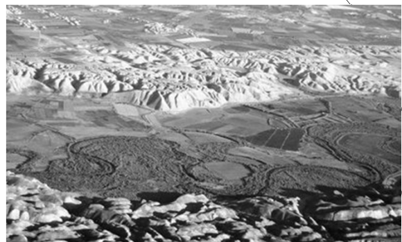
Jordan River Valley