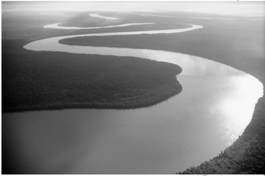
Jordan River Valley